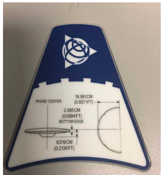
Figure 2. Zephyr Model 3